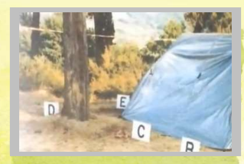
Monster of Florence crime scene photo

REGISTER for CRJU 490/690 in person or by phone (562) 985-5561 at the College of Continuing and Professional Education (CCPE) or online at